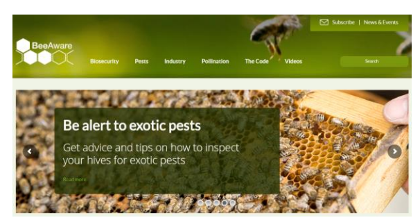
Australia's BeeAware newsletter contains helpful information on topics that affect beekeepers everywhere.

mellifera scutellata ); they mean "Asian Honey Bees" ( Apis cerana ). Similar problems, different bee. Even more obvious clues that these folks are topsy-turvy are references to January as "summer" and July as "winter"; we must translate to North Carolinian English so that their management recommendations make sense.