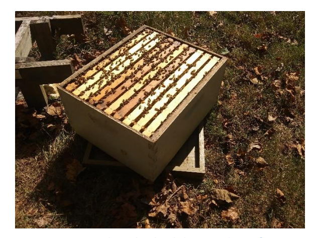
An easy way to reduce the death-by-squashing of innocent bees is to set boxes catty-corner on the rim of an upside-down outer cover.

reduce the amount of alarm pheromone that is released into the air and so will tend to reduce stinging.